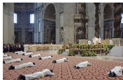
Bowing in utter submission to the pope

The priest inductees in this picture are bowing/lying prostrate before the Pope, pledging themselves to be loyal to him and the Church – a complete submission due only to God.