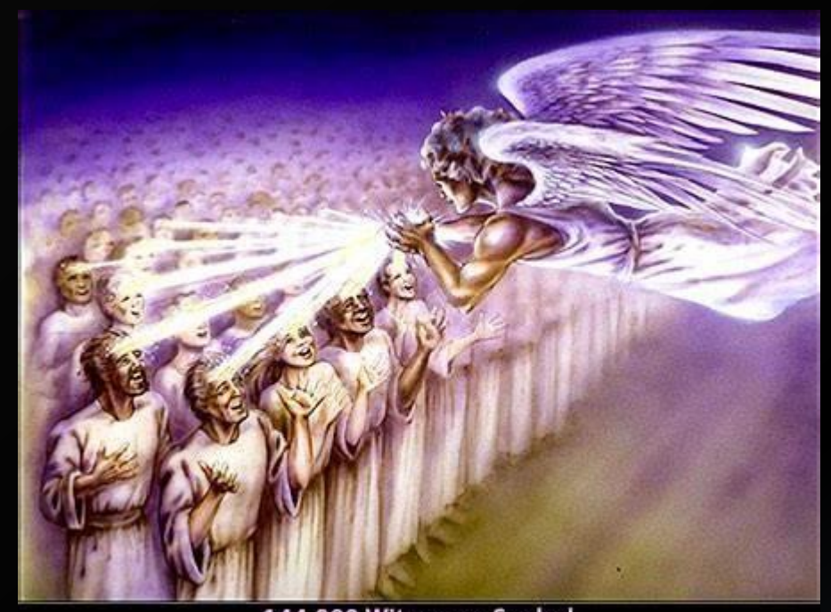
144,000 Witnesses Sealed

Revelation 3:12 tells us what distinct messages are put on the forehead. When this is done, we have formally become citizens of the heavenly kingdom forever.