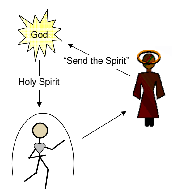
More and more I become like Jesus as the Spirit transforms my heart. This cycle never ceases.