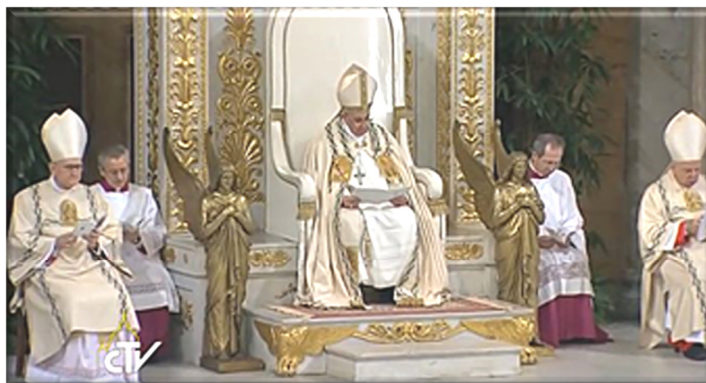
Francis on the “great white throne” Is he “judging?” Stay tuned.